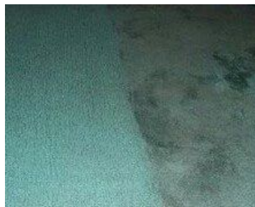
Carpet Shampoo/Stain Lifter