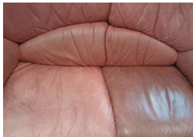
Before and After denim stains off the leather

Mix with water in a carpet shampoo machine or spray bottle. If using a carpet shampooer follow instructions associated with that machine. In a spray bottle: Spray entire area generously and wipe with a dry clean cloth or towel.